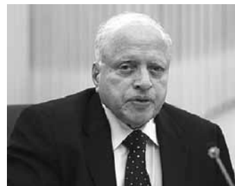
M.S. Swaminathan - Architect of "Green Revolution"

Mankombu Sambasivan Swaminathan (born 7 August 1925) is an Indian geneticist and international administrator, renowned for his leading role in India's Green Revolution a program under which high-yield varieties of wheat and rice seedlings were planted in the fields of poor farmers. Swaminathan is known as "Indian Father of Green Revolution" for his leadership and success in introducing and further developing high-yielding varieties of wheat in India. He is the founder and chairman of the MS Swaminathan Research Foundation. His stated vision is to rid the world of hunger and poverty. Swaminathan is an advocate of moving India to sustainable development, especially using environmentally sustainable agriculture, sustainable food security and the preservation of biodiversity, which he calls an "evergreen revolution".